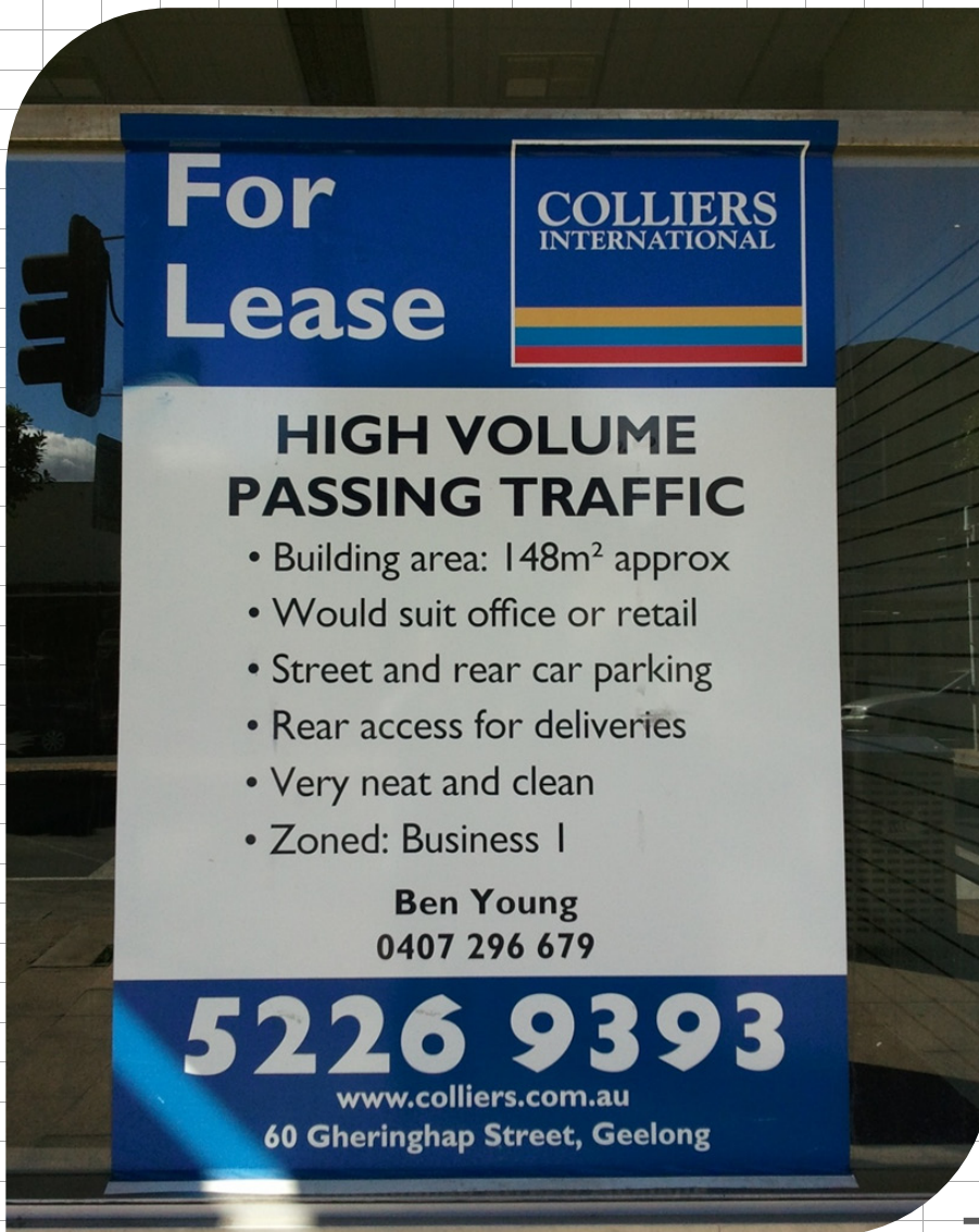
Office/Retail space for lease, Ryrie Street, Geelong, Australia