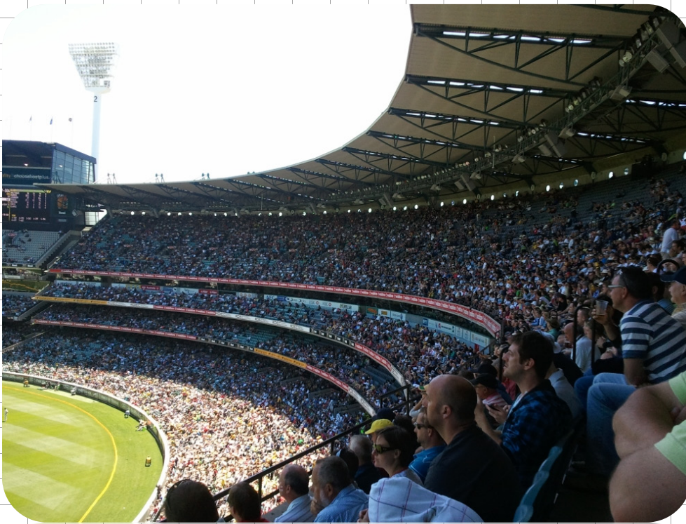
Melbourne Cricket Ground, Australia