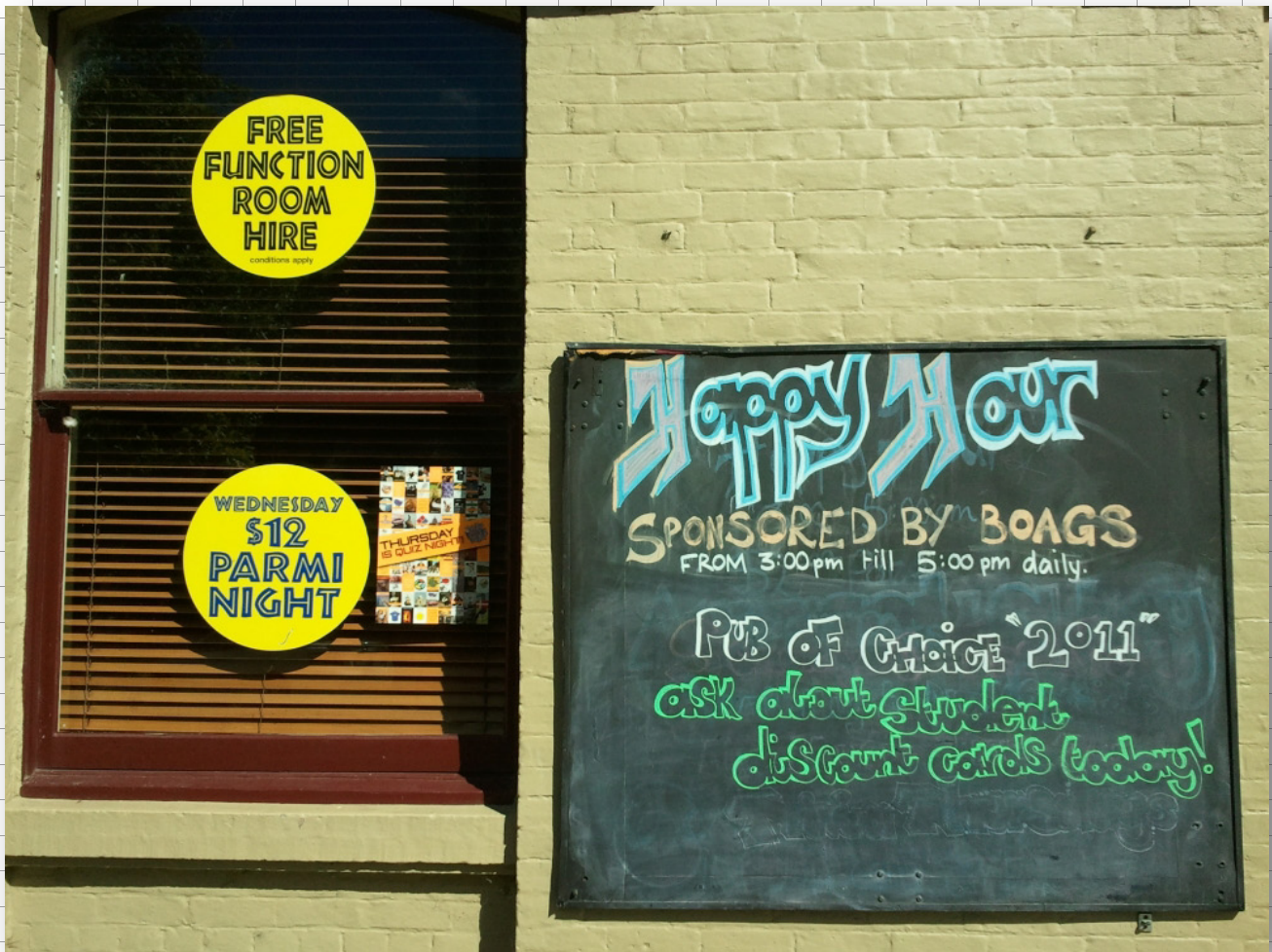
Wall outside "The Max" in Geelong City, Australia